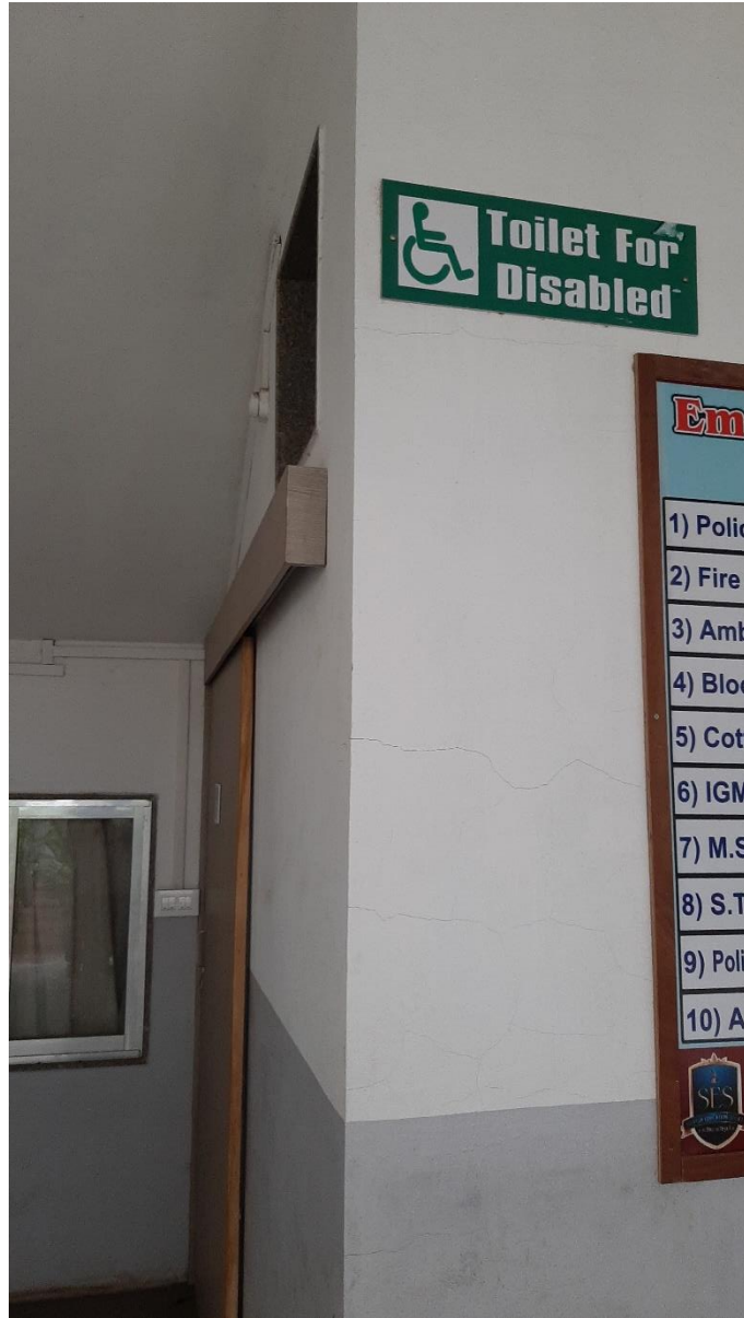
Separate Toilet facility for Divyangjan