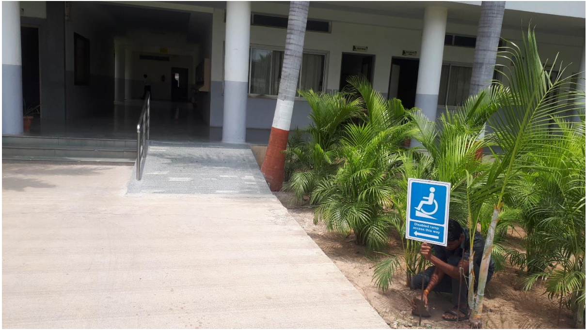
Divyangjan Friendly Ramp