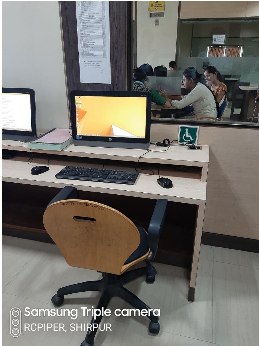
Facilities for Divyangjan