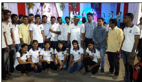
Celebrated world TB day at Cottage Hospital, Shirpur and PHC Center, Thalner