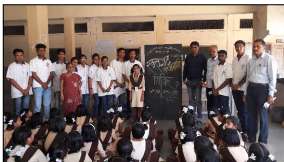
Blood Group Check Up Health Camp in Main Building