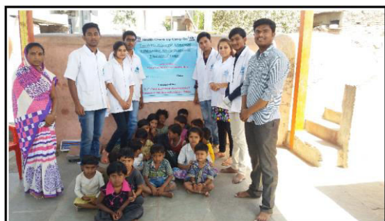
Health Check Up on Prevalence, Awareness and Treatment of malnutrition among children in Tribal area of Shirpur Taluka